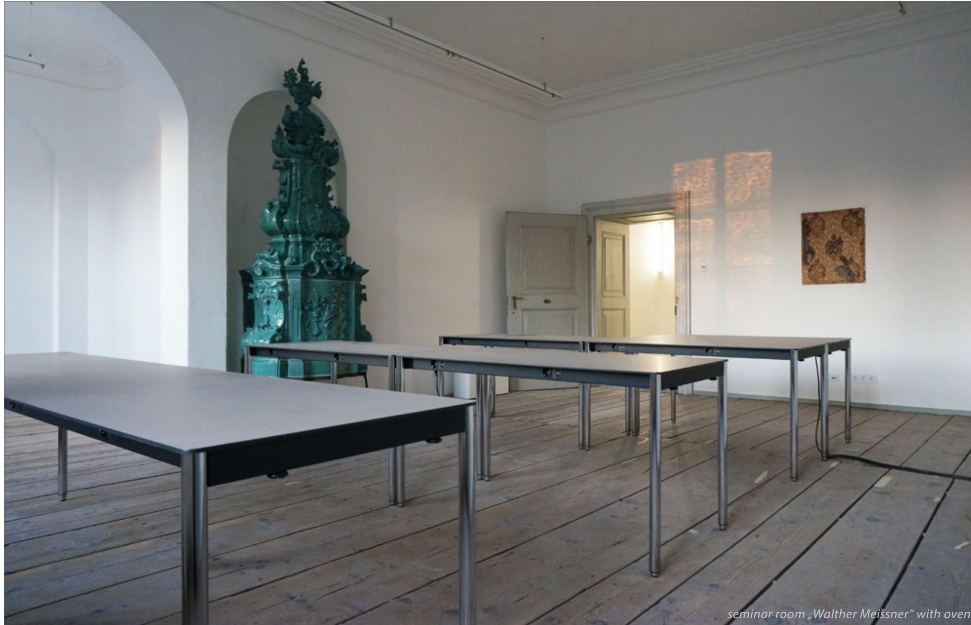
seminar room „Walther Meissner“ with oven