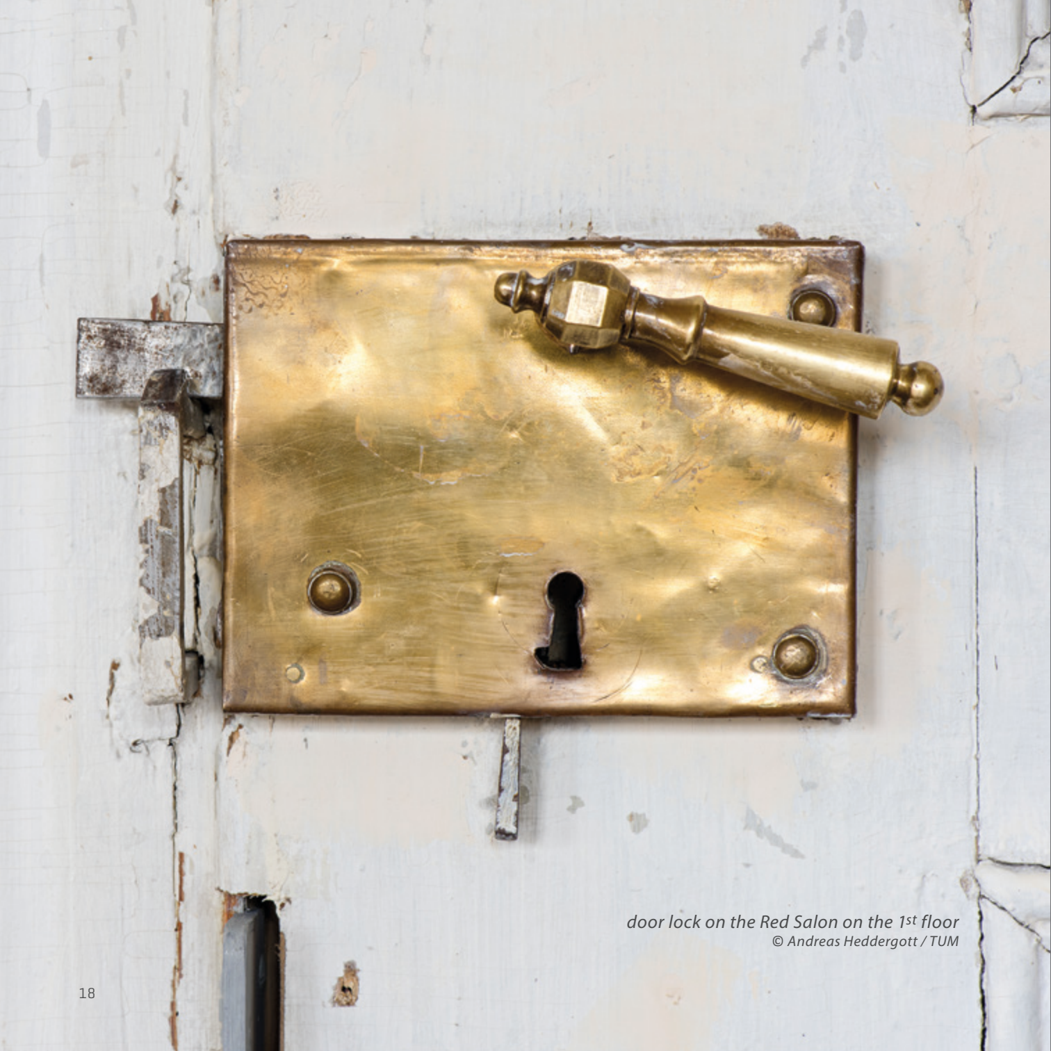
door lock on the Red Salon on the 1 st floor