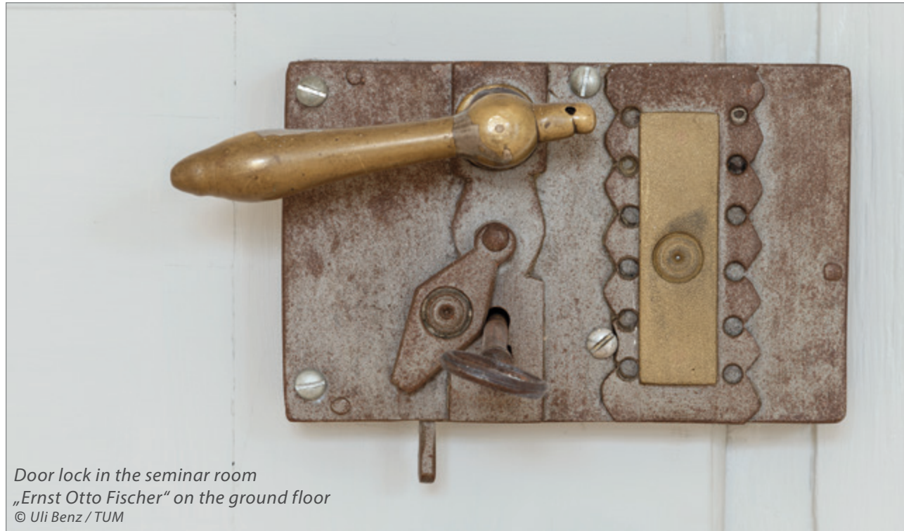
Door lock in the seminar room „Ernst Otto Fischer“ on the ground floor