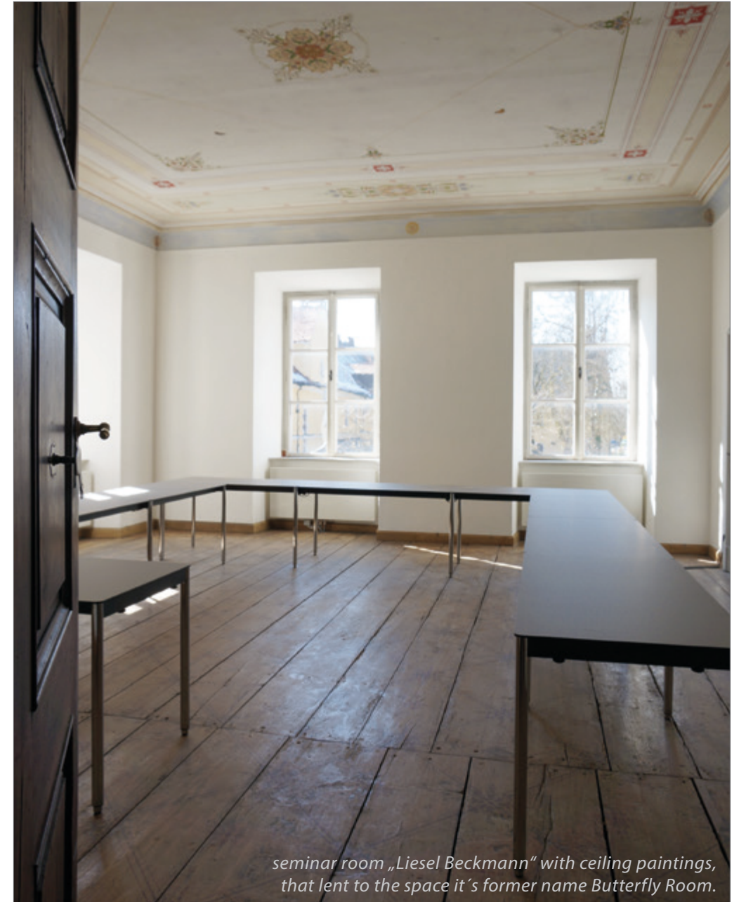
seminar room „Liesel Beckmann“ with ceiling paintings, that lent to the space it's former name Butterfly Room.