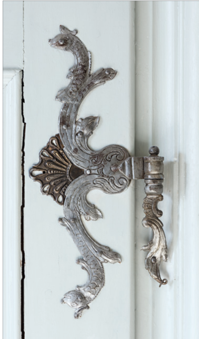
Door fitting in the meeting room „Walther von Dyck“ on the 1st floor